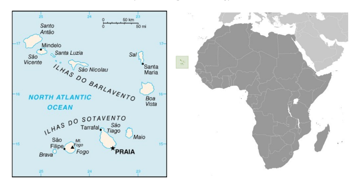
Figure 1. Cape Verde islands; Source: [50].

Cape Verde has long suffered from the adverse effects of climate adversity and climate change, as evidenced via the constant and long droughts, with the last one being the recent 4-year drought. Because of this, the Cape Verdean government has decided to fight against this problem and has been implementing several climate adaptation and mitigation measures in its 5-year development strategy (PEDS II) [49].