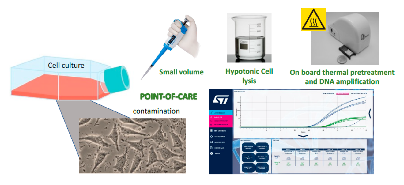
Figure 1. Sketch of the qPCR assay procedure.

An innovative protocol for qPCR working with a very low volume of raw sample (0.25 \mu L) and avoiding the step of nucleic acid extraction was optimized for a point-of-care (POC) instrument (scheme depicted in Figure 1). The optimized extraction-free protocol in minimal analysis volume, combined with the possibility to perform the qPCR assay on a portable device, demonstrates the possibility to avoid the time-consuming bacterial cell culturing. The achieved amplification of the Gram+ Staphylococcus aureus was performed in a 5 \mu L total volume of reaction, reaching the limit of detection of 1 CFU/mL.