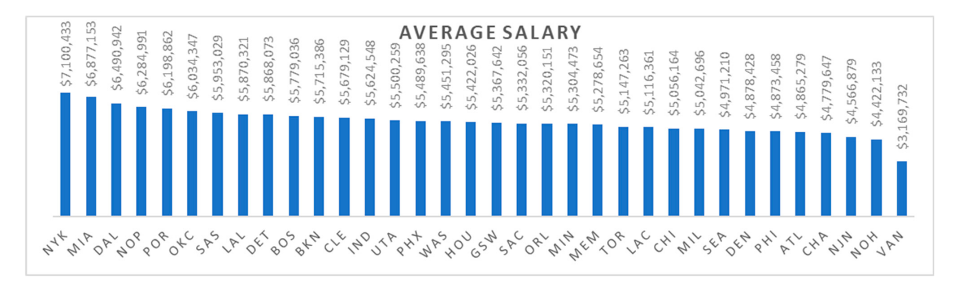
Figure 5. Average NBA player salary per team over 24 seasons (1996–2020).

In addition, this research study aimed to correlate NBA player age with salaries and advanced basketball performance analytics. Figure 5 presents a matrix with the attributes of age, salary and advanced basketball performance analytics contained by PTS, REBS, AST, TRB%, TOV%, USG%, TS%, AST%, STL%, BLK%, NetRtg, PER, WS, WS per_48, BMP or Plus/Minus or +/- and VORP which used, as the most appropriate rating, basketball analytics in the background [1,19,74–76] (RQ2 and RQ3).