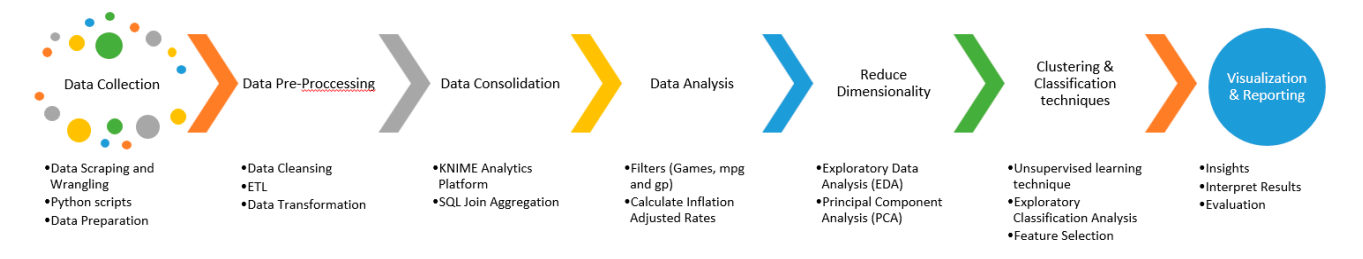
Figure 2. Data collection, pre-processing, data mining, and interpretation process.

The data model flow in Figure 2 starts with data collection from various sources, followed by data scraping and wrangling, and Python scripts for the retrieval process. Next, data preparation includes cleaning, transforming, and normalizing the data for analysis. Data pre-processing involves cleaning and transforming data to remove any inconsistencies or errors, while data cleansing identifies and corrects or removes errors and inaccuracies through KNIME Analytics tools. ETL transforms data from different sources into a format suitable for analysis and loads them into a data warehouse. Data transformation converts data into another format to make them suitable for analysis, while data consolidation combines data from multiple sources into a single dataset.