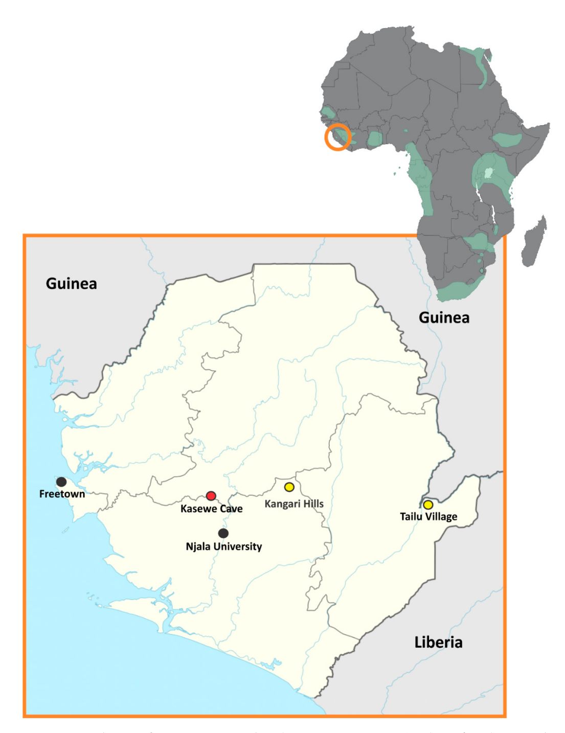
Figure 1. Distribution of Egyptian rousette bats (ERBs; Rousettus aegyptiacus ) in Africa (upper right corner) with Sierra Leone highlighted by orange circle. Map of Sierra Leone (lower left corner) showing zoonotic surveillance trapping sites (red and yellow dots), Njala University and Freetown (black dots).