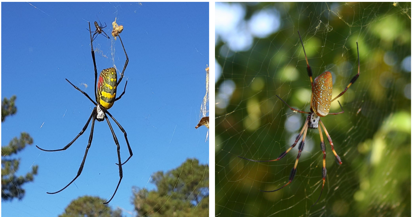
Figure 1. (Left): Jorō spider, Trichonephila clavata , photographed in Oconee County, GA, USA, on 3 October 2022. (Right): Golden silk spider, T. clavipes , photographed in Richmond County, GA, USA, on 30 September 2022.

Specifically, we evaluated the jorō spiders' behavioral responses to threats by timing their thanatosis (freeze response) reactions to a mildly stressful stimulus, i.e., a puff of air [13]. Such air puff tests have been employed in other investigations of spider behavior, because the duration of thanatosis is a good proxy for the perceived threat level and/or the individual behavior of the spider [14]. Spiders that remain in a thanatosis state for longer are thought to be “shyer”, while those that show little or no reaction are thought to be more “bold”. For comparison, we also evaluated the thanatosis reactions of the golden silk spider, which, if similar, would indicate a shared trait within the genus. We also collected similar behavioral data on three spider species from the local area, plus we collated similar published data on five other species that are native to, or have ranges within, North America.