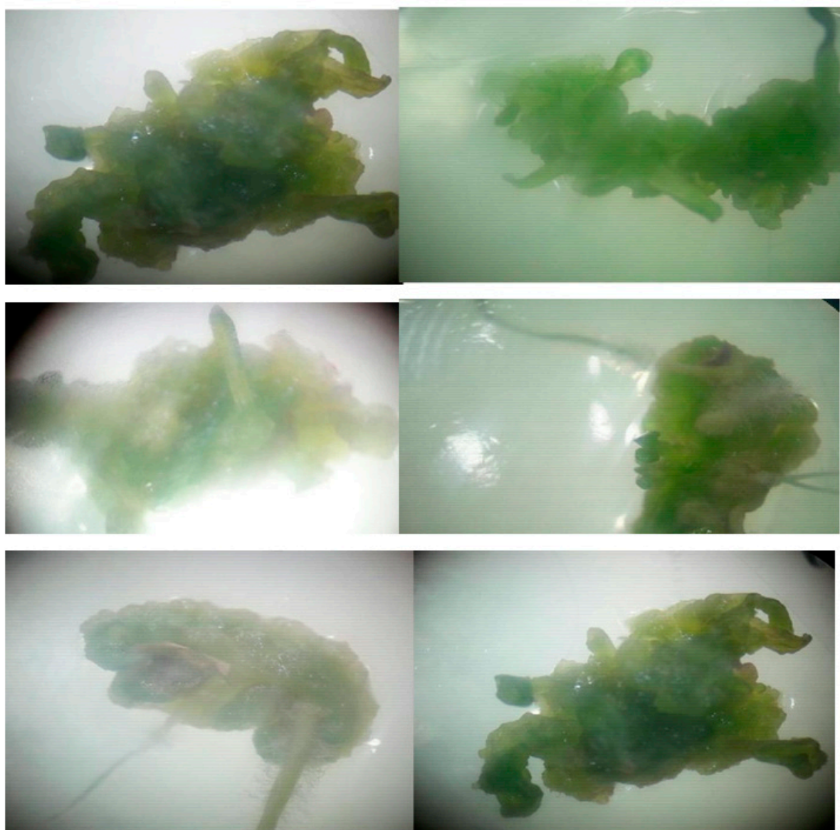
Figure 1. Calli regeneration from explants after two weeks.

All data represent the mean \pm standard deviation of at least three independent experiments. Means with different letters in the same column were significantly different at the level ( p < 0.05 ); n = 3 .