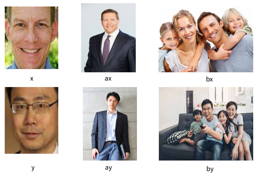
Figure 1. One example set of images for measuring race bias, where the targets are face images of European American and Asian American while the attributes are Career and Family . The images labeled with ax , bx , ay , and by are images that depict a target in the context of an attribute.

This normalized measure implies how separated the two distributions of associations between the target and attribute are. That is, a larger effect size indicates a larger differential association.