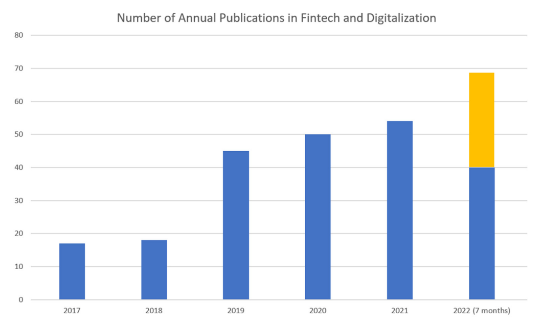
Figure 1. The number of Academic publications in the Islamic Fintech and Digitalization area (Yellow indicator is for a 12-month projection).

Overall, the new concepts and technologies coming with the Banking 4.0 are clear game changers, and institutions are well aware of this. A clear sign of this awareness is seen in the recent surge in academic studies in the financial digitalization and fintech areas. Figure 1 shows the number of academic publications reviewed in this systematic literature review, illustrating the growth in the number of papers.