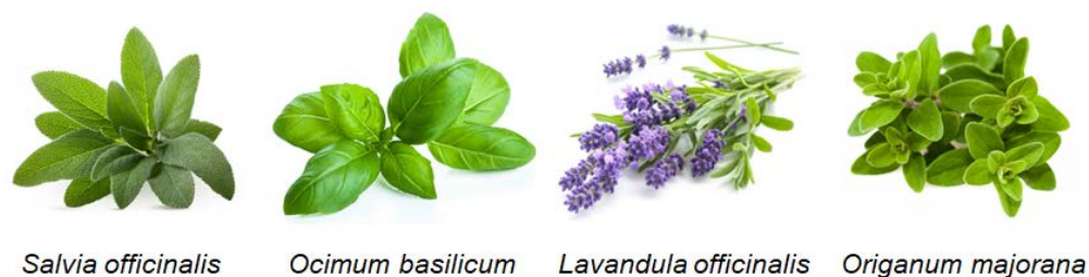
Figure 1. Photographs of the studied plants that belong to the Lamiaceae family. The species of these genera have been used as examples.

Since this study concerns only a few plants of the Lamiaceae family, we propose hereinafter an overview of these studied plants, namely sage ( Salvia ), basil ( Ocimum ), lavender ( Lavandula ), and marjoram ( Origanum ) (Figure 1).