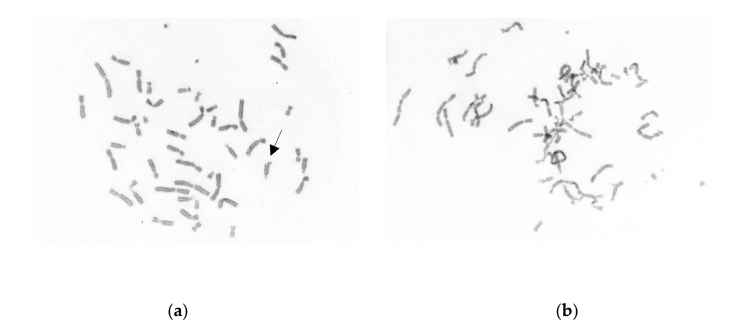
Figure 2. CI pattern in metaphases from DEB-induced (0.1 \ \mu g/mL) lymphocyte cultures ( a ) Selected metaphase from a control. One chromatid break can be seen; ( b ) Selected metaphase from a severe asthma patient. High level of chromosome instability can be visualized, with multiple breaks and rearrangements.

As shown in Figure 1, DEB-induced lymphocyte cultures from severe asthma patients have a significant increase in the levels of OS-related CI, when compared to controls, both at 0.05 \mu g/mL and 0.1 \mu g/mL DEB concentrations, either in percentage of aberrant cells (p < 0.001 and p < 0.0001, respectively) or mean number of breaks per cell (p < 0.01 and p < 0.001, respectively) or mean number of breaks per cell (p < 0.01 and p < 0.001, respectively). Figure 2 is an example of the mild DEB-induced CI in a cell from a normal individual, where only a chromatid break is seen, and the increased DEB-induced CI in a cell from a severe asthma patient, with multiple chromosome breaks and rearrangements.