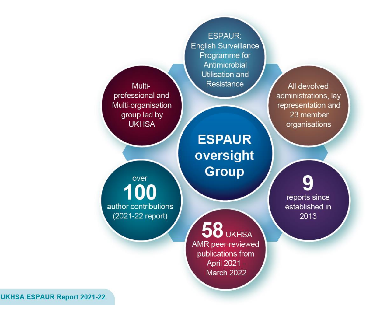
Figure 2. Key outputs of the ESPAUR oversight group. Reprinted with permission from Ref. [4]. Copyright 2022 UK Health Security Agency.