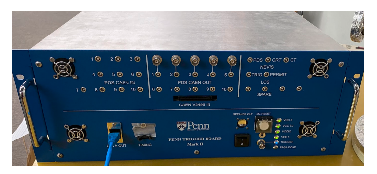
Figure 1. Front view of the Photon Trigger Board (University of Pennsylvania, Philadelphia, PA, USA), showing connectors in the chassis for some electronic subsystems: PDS, timing and LArTPC (NEVIS) trigger board.

The Penn or Photon Trigger Board (PTB, shown in Figure 1) intersects all the SBND hardware trigger components. Previously used in DUNE 35-ton prototype [11], PTB is a motherboard that establishes hardware interface with the trigger subsystems, while a field-programmable gate array (FPGA) implements trigger logic and has interface with the timing system. A Linux-based CPU configures the FPGA and communicates with the DAQ software v1_08_02. Both FPGA and CPU side are part of the MicroZED [12] programmable board (Avnet, Pheonix, AZ, USA).