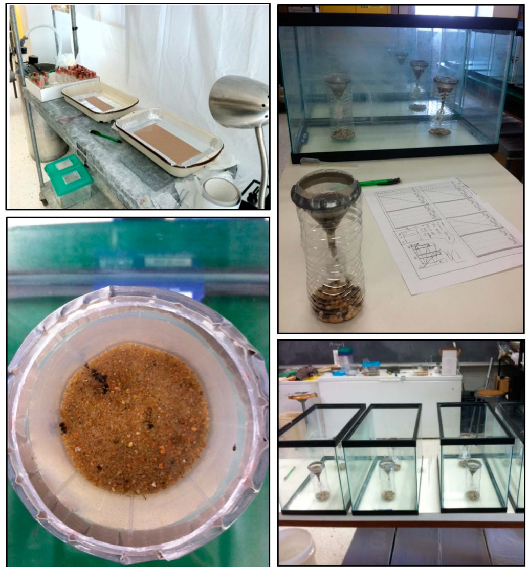
Figure 1. To assess flight of Heterosternuta sulphuria and H. phoebeae (top left), beetles were placed in small shallow pans (35 cm L \times 23 cm W \times 5 cm H, top left) with a piece of cardboard fastened to the bottom of the pan. The sides of the pan were sufficiently steep and slippery to prevent any escape by crawling beetles. An incandescent 60 W light and a white curtain were hung above and enclosed the observation area to slightly increase the ambient laboratory temperature while also providing soft lighting to mimic sunlight. Small, plastic disposable funnels (26 cm D \times 30.5 cm H) filled with sand substrate were used to represent wet and drying habitats (bottom left, and images on right).

across all observations (Table 1). Each individual was tested only once. Following flight observations, all individuals were killed and stored in 70 percent ethanol. Individuals were removed from ethanol for determination of body size ( L \times W ), species confirmations, and sex. Body length was measured using a lens micrometer fitted to a stereomicroscope, with length ( L , mm) measured as the distance from the front clypeal margin of the head to the apex of the elytra, and width ( W , mm) measured as the distance across the widest point of the elytra. The sex of each individual was determined through observation or dissection of genitalia. Flight capacity among species was compared between the two species using a chi-square test in SYSTAT version 13.00.05.