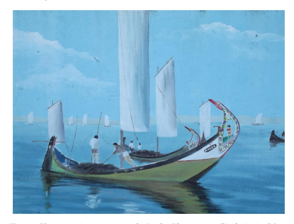
Figure 5. House painting representing the "moliço" harvesting at Ria de Aveiro (Murtosa, Aveiro, Portugal), which "moliço" consist in the harvest of seaweeds and aquatic plants to fertilize the agricultural soil, seaweed tradition, and regional cultural heritage.

Whilst in others, this use was seemingly forgotten, and seaweeds have mostly served as various raw materials for a variety of practical uses and extracts, often in remote ways where most people would not know that a specific application was actually based on a specific type of seaweed, such as a food ingredient, a hydrogel, a medicinal aid, or a fire repellent [112]. Demonstrating that in various human communities seaweed has had high cultural heritage value (Figure 5) since ancient times, there is a seaweed-related cultural heritage notorious in Shandong province (China). In this province there are the so-called "seaweed bungalows" (seaweed are used to cover the rooftop) which is dated from the Qin Dynasty (221–206 BC) and continues today and it is a listed provincial intangible cultural heritage in Shandong [112,117]. Other cultural heritage is gastronomy related, for example in Azores Islands (Portugal) and in Ireland there are recipes with seaweeds (mostly with Porphyra sp.) which have been maintained for centuries [118].