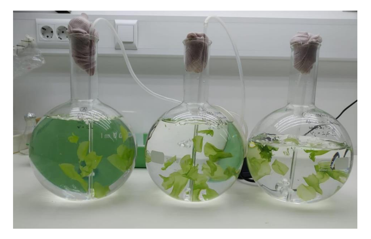
Figure 4. Seaweed juvenile cultivation for aquaculture upscaling.

The most immediately recognized services are the direct usage of seaweeds products as food, textiles, medications, and decorations (provisioning services). These provisioning services are provided by four distinct sources. Seaweed aquaculture in the supply chain is used more in the provisioning service (Figure 4). The second supply source is related with seaweeds taken directly from nature, the biomass of which is used for a variety of uses by local populations [9]. A third source is the biomass of seaweed, which grows abundantly in nature, and in this instance, harvesting and using their biomass represents a solution to a problem (which occurs with invasive species, for example) [14].