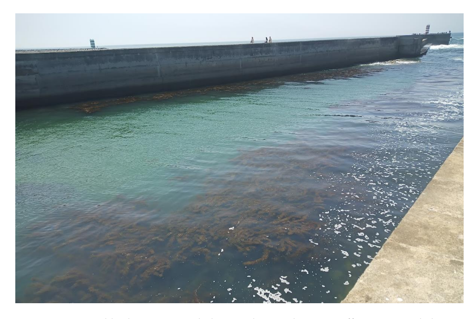
Figure 3. Seaweed beds on aquatic habitat reducing the wave effect in coastal shore, trapping the sedimentation and reducing coastal erosion.

Erosion regulation is also linked to seaweed colonization. Seaweeds prevent erosion and sediment trapping, aiding in the maintenance of saltwater environments' shorelines (Figure 3). Shore erosion is reduced because seaweeds act as physical barriers that minimize wave energy [39,73]. This is also observed in estuarine seaweeds that trap sediment in the river margins [39]. Beach-cast seaweeds may provide indirect coastal protection by releasing nutrients to dune ecosystems, which in turn stabilize local sediments and contribute to coastal protection [74]. There is little scientific evidence to imply that drift deposits on beaches actually provide coastal protection. However, if present on a big enough scale, they may be able to diffuse wave energy, shielding sediments from wave scour on a small scale [39].