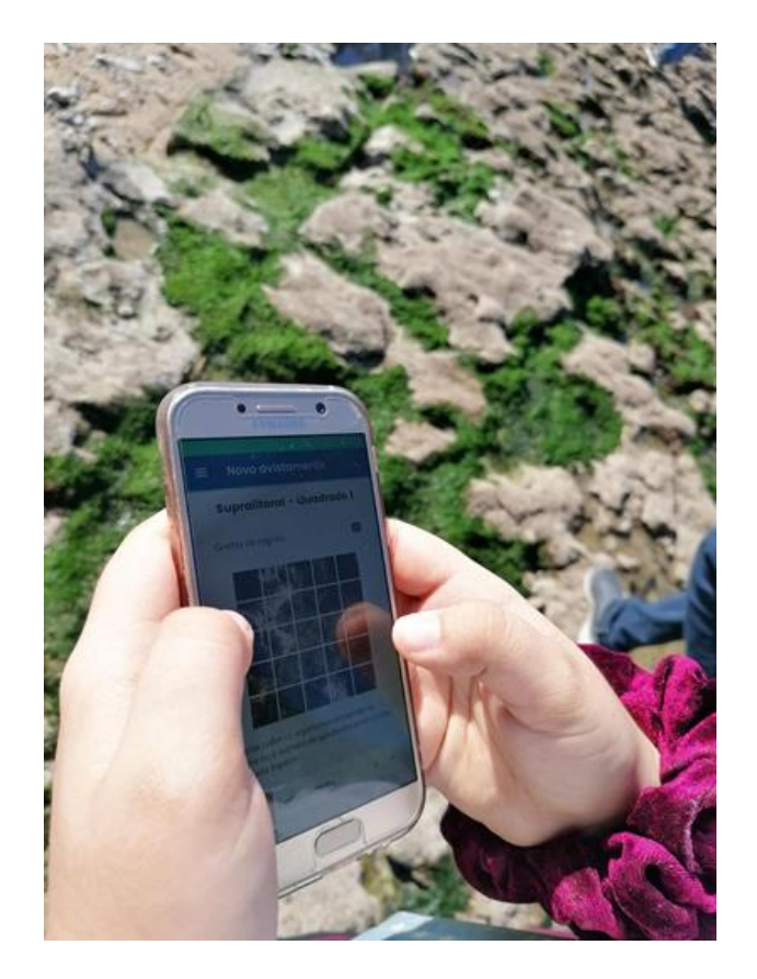
Figure 6. Educational program "Roteiro-entre-marés" app regarding seaweeds natural occurrence.

There also educational values associated with seaweed. Students may have their first encounter with seaweeds during formal schooling during biology lectures, when they go on field trips to the beaches. Beach field tours on rocky coasts with seaweeds and other aquatic organisms are also used to educate children on the fundamentals of ecology and food webs. Seaweeds are easily seen and hence contribute to the transfer of important ecological ideas and principles. Currently, there is an increase in education-related scientific projects (in Europe Union, specifically) which transmits educational values about the sea ecosystem importance, thus seaweed importance in ecological values. For example, the "Roteiro-entre-Marés" (Figure 6) try to enhance the natural and cultural resources linked to the Portuguese coast, specifically the intertidal zone (inclusively seaweed), using as an example two distinct coastal ecosystems [133]. However, this type of educational value are being promoted by interactive learning and using information technologies to promote and spread ecosystem services for a broader target to promote ecological sense and knowledge [134]. In the USA, there are associations also promoting seaweed educational values [135].