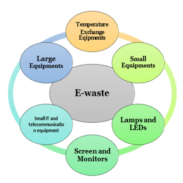
Figure 1. Composition of E-waste.