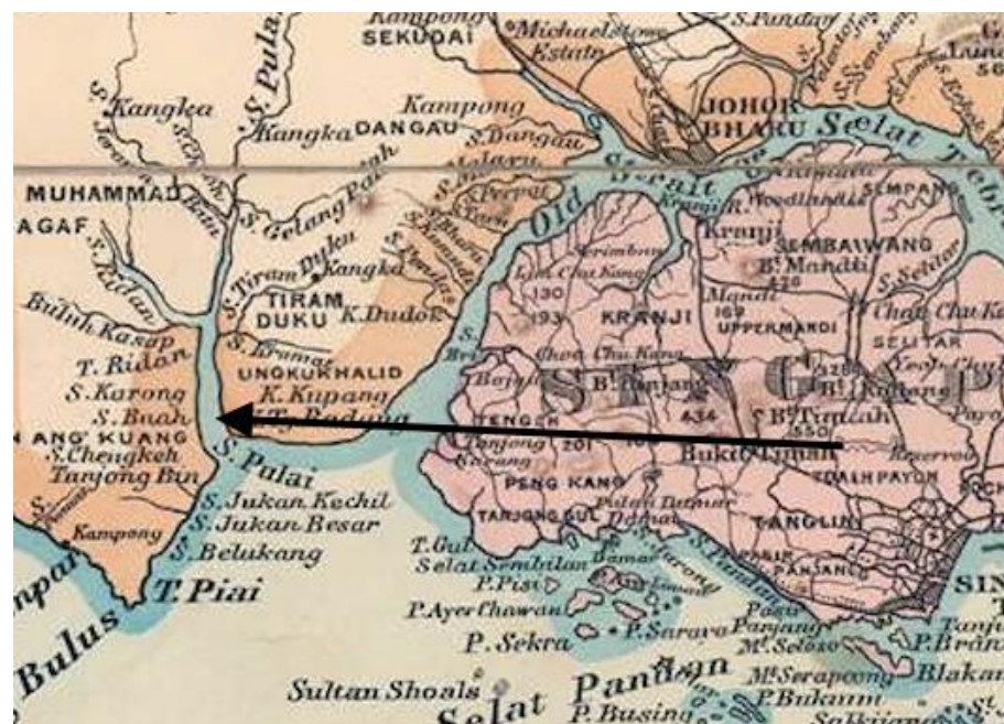
Figure 3. 1898 Cuylenburg/Stanford Map of Malay Peninsula: Malaysia, Singapore, Siam.

Upon the British eradication attempt of the Orang Laut after 1819, the Orang Kallang were also impacted as the British designated the Kallang region as a supplementary trading center. As a result, the Temenggong (Temenggong is a traditional title for a Malay nobleman ranking third after the ruler of the old Johor empire) resettled most of the Orang Kallang to the Pulau River in Johor [14]. However, according to accounts by the purported descendants of the Orang Kallang , a small population remained and thrived on the Kallang River up to the 1930s [8]. Figures 3 and 4 show geographical references of the direction of migration by the resettlement.