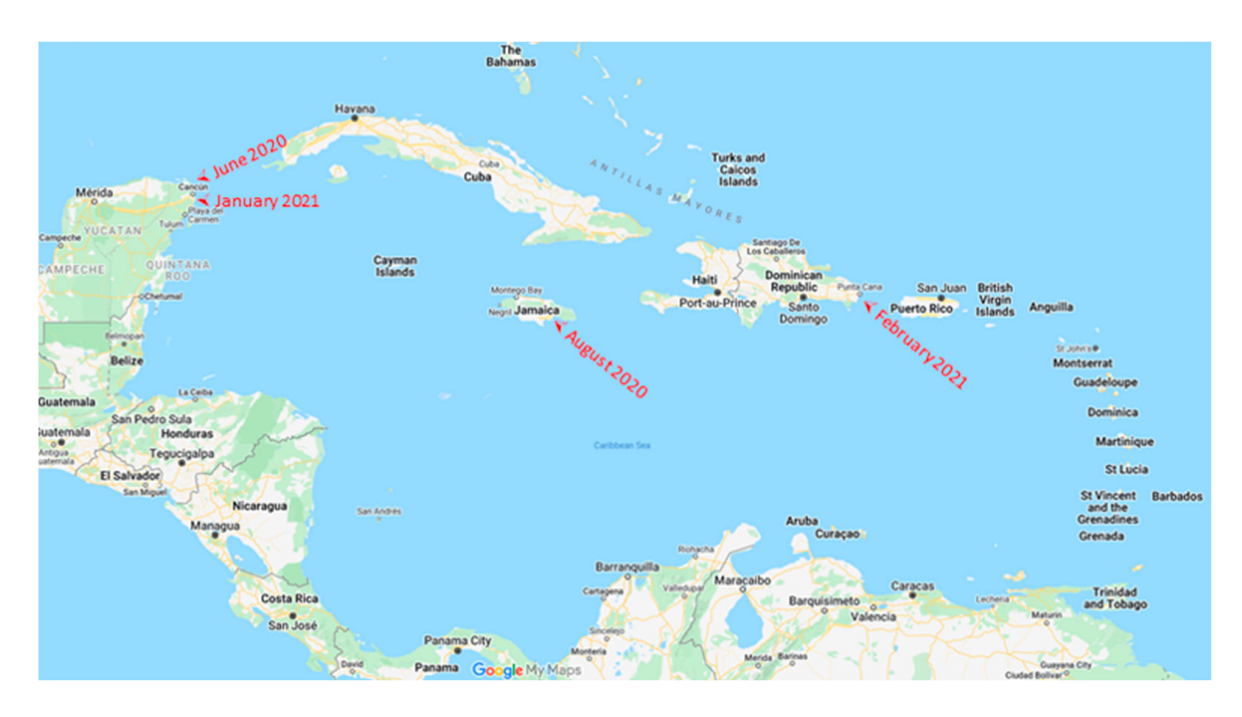
Figure 1. Sargassum sampling locations and dates across the Caribbean.