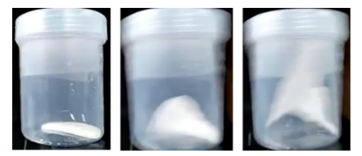
Figure 1. Pictures of the climbing colloidal suspension of 70 wt. % silica particles of 1.0 \mu m diameter with water under horizontal vibration. The corresponding movie is given in Supplementary Materials. The left picture shows the suspension at rest, and the middle (~8 s in the movie) and right (~12 s in the movie) ones are under vibration.