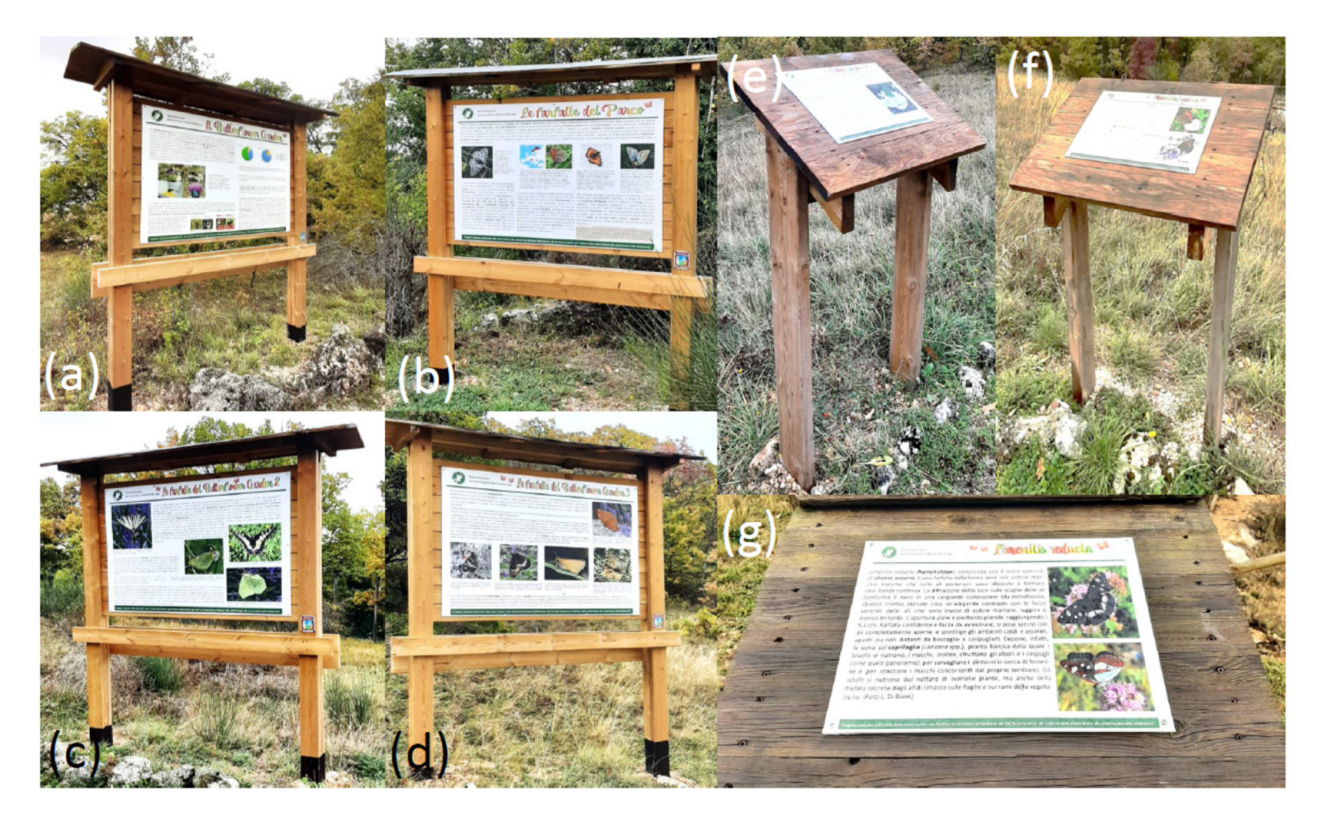
Figure 4. Examples of large ( a – d ) and small ( e – g ) posters installed in the San Colombo Botanical Garden of Gran Sasso and Monti della Laga National Park (Italy) to illustrate the importance of insect conservation and the butterfly garden ( a ), the variety and peculiarities of the butterflies of the park ( b ), the butterfly community of the garden ( c , d ), and a selection of species occurring in the garden among the easiest to observe and identify ( e – g ).