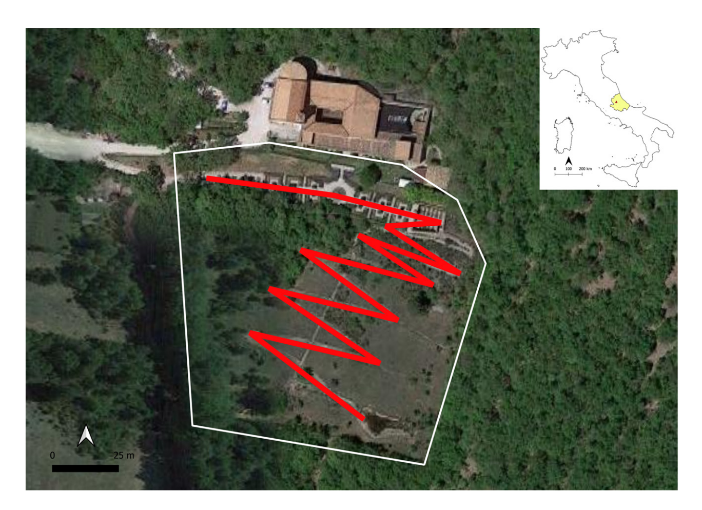
Figure 1. The Botanical Garden (San Colombo) of the Gran Sasso and Monti della Laga National Park (Italy). The white line indicates the perimeter of the garden, whereas the red line indicates the transect used for butterfly censusing. The inset shows the position of the botanical garden (red point) in Italy (the Abruzzo region is colored in yellow). Map generated in QGIS<sup>®</sup> with Bing Virtual Earth background [90].

The botanical garden was the garden of a former convent (the Convent of San Colombo), which is now converted into a reception facility for conferences, weddings, and ecotourism; thus, this site is visited by people that come here for the most disparate reasons. This may be particularly important to promote insect conservation to occasional visitors. In this way, the butterfly garden may also help in promoting insect conservation (especially in the form of awareness) to people that are not already interested in nature. Additionally, the area includes a pre-existing path which zigzags along a slightly steep slope, which is easy to walk. Finally, the garden has a small pond that provides butterflies with water in the driest periods.