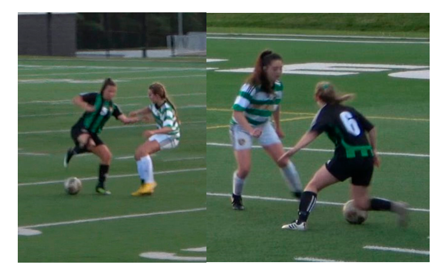
Figure 2. Players making 180° and 90° CODs with ball in the game.

identified for each identified COD and included following features: (1) ball possession (player/team), (2) running speed (low/moderate or fast), (3) body contact with other players during COD movement, (4) turning side (right or left), (5) the angle of COD movement (90° cut, 135° cut, and 180° pivot turn), and (6) being challenged by an opposing player. Ball possession (player/team) was based on the ball possession definition presented by Link et al. [33]. Contact from other players to any body part was identified during or right before the COD maneuver and a challenge was identified as an action from opposing player that forced a perception–reaction response. Fast running speed was identified when the player was chasing the ball/opponent or being chased while having ball possession. Low/moderate speed was identified when a player was jogging and/or not pressing/being pressed. All COD movements, including field position (left/right, attacking/defensive half/field coordinates) for each COD and time of game (minute, first/second half) were identified using a soccer-specific tagging panel (Dartfish Live S). One reviewer (AMA), who has over ten years of experience in soccer coaching and game analysis, completed the video analysis.