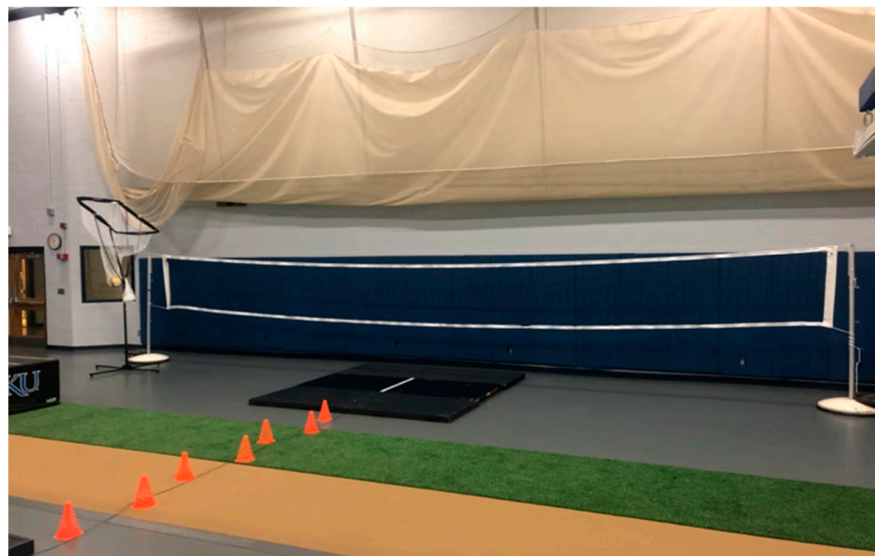
Figure 1. The experimental setup.