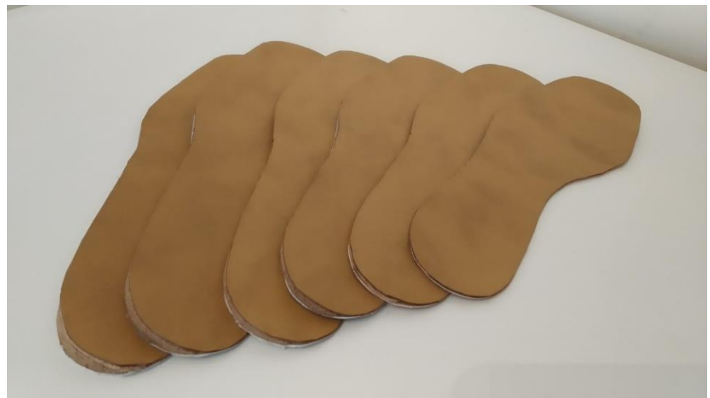
Figure 1. The six experimental insoles used in the study.

The insoles were full length, custom made with pronating wedges along the lateral border of the foot to the head of the fifth metatarsal (Capron Podologie, France; Ref.: 8004F) (Figure 1). Participants used their own shoes (flat shoes without heels or wedges) to decrease the relevant biomechanical changes with the use of unfamiliar shoes [25]. The insoles were adapted to the size of the feet and were worn bilaterally, but only the data for the most painful knees are presented.