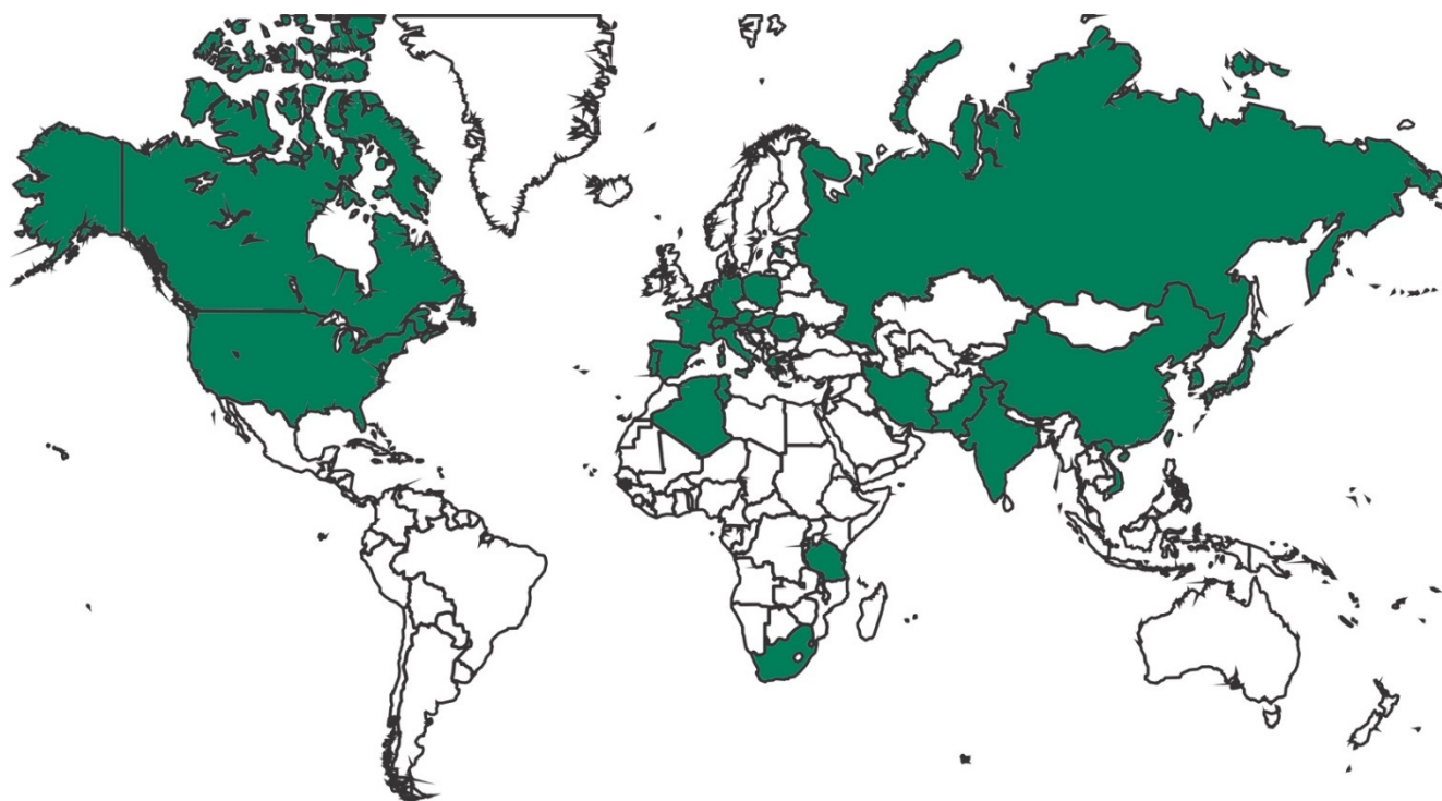
Figure 2. Geographic distribution of the authors who participated in Compounds during the past two years.

Another noteworthy development is the international expansion of Compounds , including the diversification of the geographical origins of the authors who participated this year (see Figure 2). This is another significant achievement.