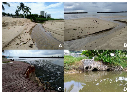
Figure 1. Areas of sampling with sewage discharge on the beaches. (A–D): sewage discharge.

Soil samplings ( n = 42 ) were performed on the beaches and encompassed an area of approximately 38.14 km of the seafront. Briefly, samplings were carried out at 42 points from 5 a.m. to 7 a.m. For each collection point, an area of 100 m 2 was delimited and the soil was collected of five sub-points (four on the corners and one in the center). The collection was carried out in a superficial layer up to 5 cm deep with 100 g at each point, totaling 500 g of soil. In some areas of sampling was observed the presence of sewage discharge on the beach, as well as the presence of domestic animals (Figure 1).