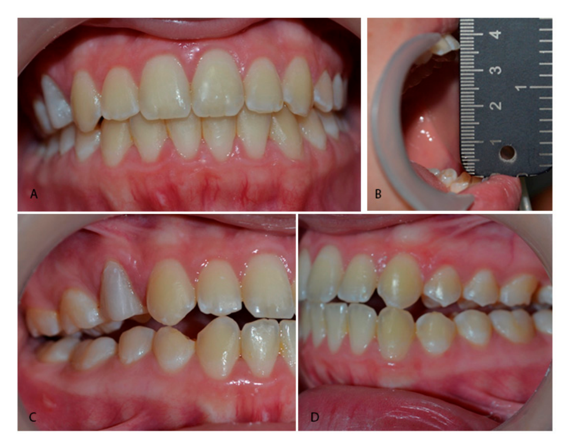
Figure 2. Intraoral photos of the ( A ) dental occlusion; ( B ) maximum opening; and ( C , D ) mandibular lateral excursions, showing the stability of the mandibular dynamics ten years after the myofunctional treatment of the mandibular condylar fracture.