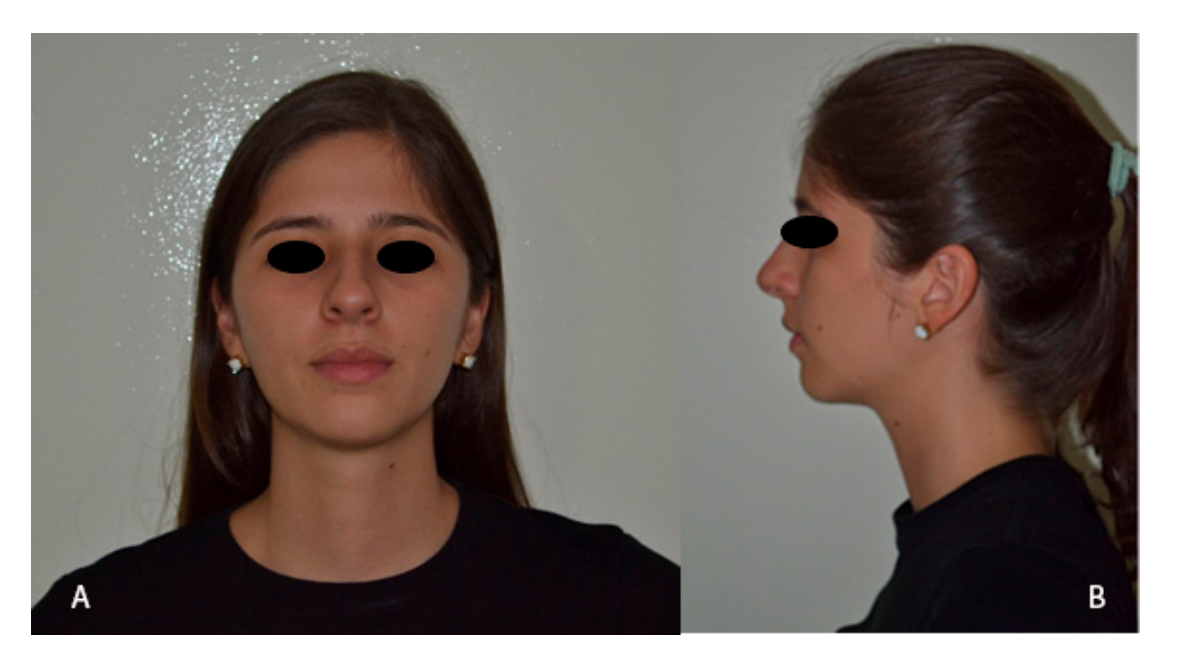
Figure 1. ( A ) Frontal ( B ) and profile photos of the face of the reported patient ten years after the myofunctional treatment of the bilateral mandibular fracture.