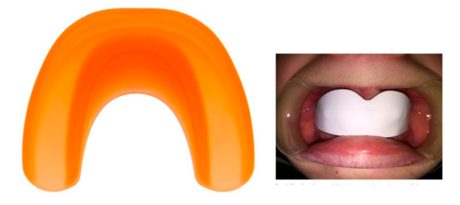
Figure 1. The Equilibrator Eptamed C3P orange and the Equilibrator C3P white in the oral cavity of the patient.

by their extreme simplicity in terms of their use by the patient, their safety, and their construction. Elastodontic devices allow the dentist to finalize the treatment and create a harmonious and natural smile obtained using comfortable and non-invasive appliances. The aim is to achieve balance in the oral cavity without creating problems in other areas of the body. All of this can be obtained by stimulating the patient to use their own strengths (tongue and chewing muscles) and enabling their natural growth and remodeling potential to solve the problem of malocclusion [4,5]. For this reason, it is also called an activator or equilibrator (EQ) device. In selecting the most suitable device for the individual patient, after taking alginate impressions and developing cast stone models, the orthodontist uses an appropriate ruler to measure the distance between the palatal cusps of the first upper bicuspids (or the first upper deciduous molars) and will then choose the correct size. Three different materials are available based on hardness: white in natural rubber (soft), and orange or mint in elastomeric resin (medium and hard, respectively). The patient inserts his or her teeth in the upper and lower splint fittings as shown in Figure 1. This device is functionalized through soft elastic forces, led by muscle energy, by biting into it. The activator is worn all night and for 1 h during the day [6].