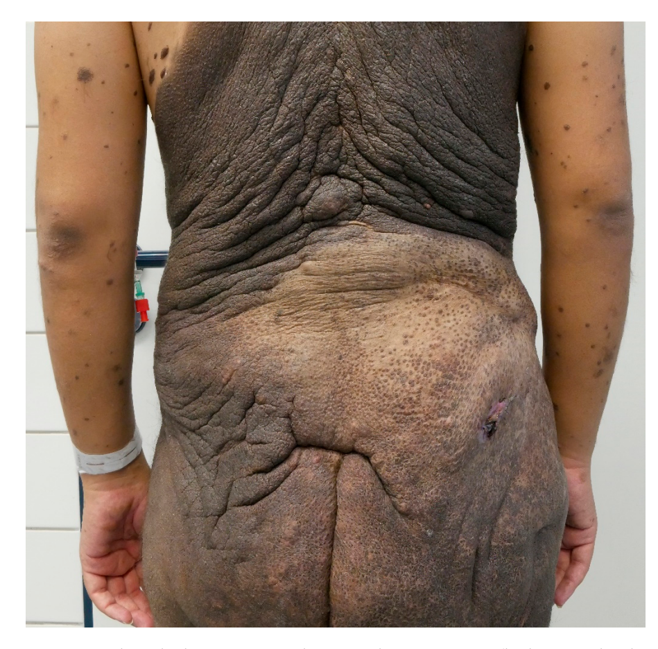
Figure 2. A closer look at a congenital giant melanocytic nevus (bathing trunk subtype) showing huge skin folds with neurofibromatosis-like appearance.

logical examination revealed a huge CGMN presenting as huge brownish black, partly hairy bathing trunk nevus including several tumorous nodules. There were countless satellite nevi on the entire body. Moreover, there were huge skin folds with neurofibromatosis-like appearance (Figure 2) [1].