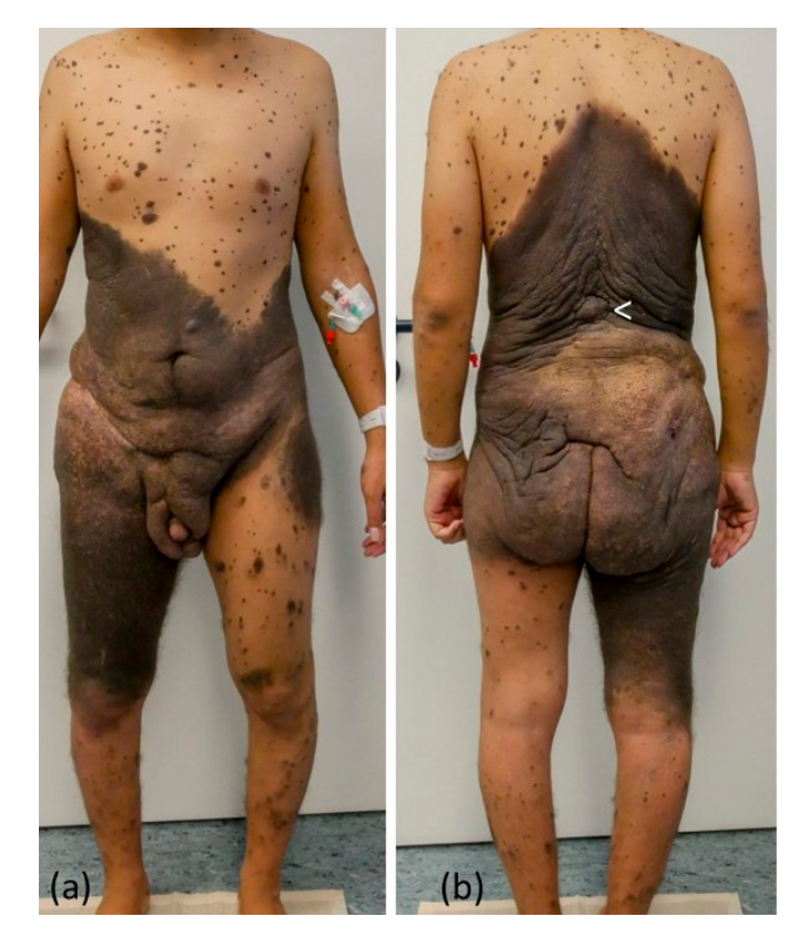
Figure 1. An adult male with congenital giant melanocytic nevus presenting as huge brownish-black partly hairy bathing trunk nevus including several tumorous nodules (arrow head, ( a , b )). Moreover, there were countless satellite nevi on the entire body.

Dear Editors: Giant congenital melanocytic naevus (GCMN)-associated melanoma in adults is very rare [1]. We here report an adult male with fatal GCMN-associated melanoma despite the initiation of combined immunotherapy (Figure 1).