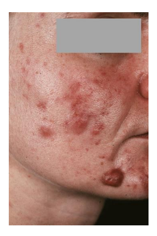
Figure 1. 31-year-old patient suffering from severe late-onset acne tarda.

The clinical features of acne tarda are quite specific: inflammatory acne that include superficial lesions such as papules and pustules ( \leq 5 \text{ mm} in diameter) and deep pustules or nodules in the lower facial region or macrocomedones (microcysts) spread over the face (Figures 1 and 2). Involvement of the trunk is much more common in men [5]. The disease can be classified as mild, moderate or severe and in accordance with the lesions that predominate in a given patient: comedonal, papulopustular, nodular, nodulocystic or conglobate acne (acne conglobata) (Table 1) [10].