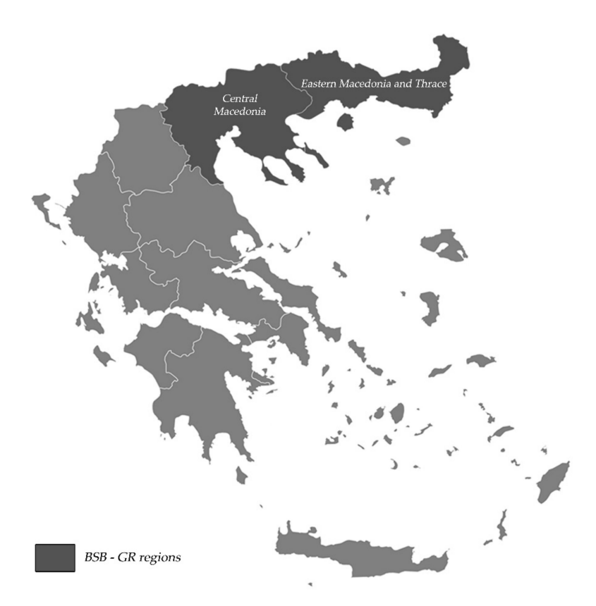
Figure 1. Study area.

According to national statistics [24], in 2019, regarding arrivals, the region of Central Macedonia contributed to Greece's tourism scene by a share of 12%. The Regional Units of Thessaloniki and Halkidiki are the two major tourist destinations in the region. Throughout 2014–2019, the region marked a considerable increase in arrivals, of 45%, though this is lower than the national average. The region of Eastern Macedonia and Thrace plays a rather limited role in the country's tourism scene, as it concentrates just 3% of the county's total arrivals in tourist accommodations. In 2019, more than half of the arrivals were recorded in the Regional Units of Kavala–Thasos (51.2%). However, the region achieved a significant increase of more than 30% in arrivals during 2014–2019. The region of Central Macedonia concentrates more than 10% of the total overnight stays in the county, while Eastern Macedonia and Thrace concentrates just 2.3%. During 2012–18, overnight stays increased in both regions.