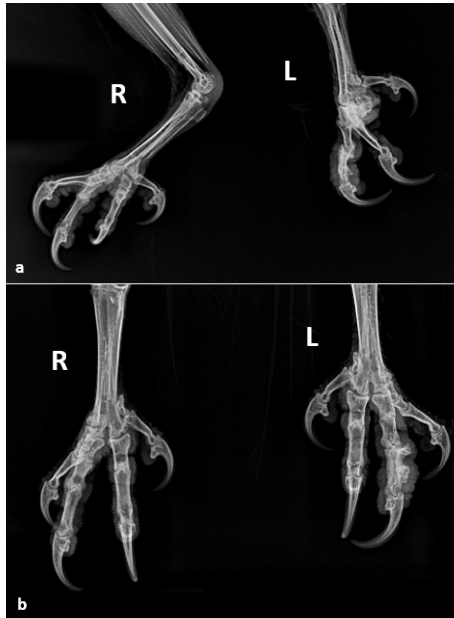
Figure 3. Verreaux's eagle owl feet six weeks post-treatment. Lateral (a) and DP (b) follow-up radiographs taken six weeks post-removal of the cable tie.

The osteolysis of phalanx 2 in digit three on the left foot had resolved. Osteophytes were still appreciable, particularly at the proximal end of the bone, but the width of the bone had increased to exceed that of the contralateral foot.