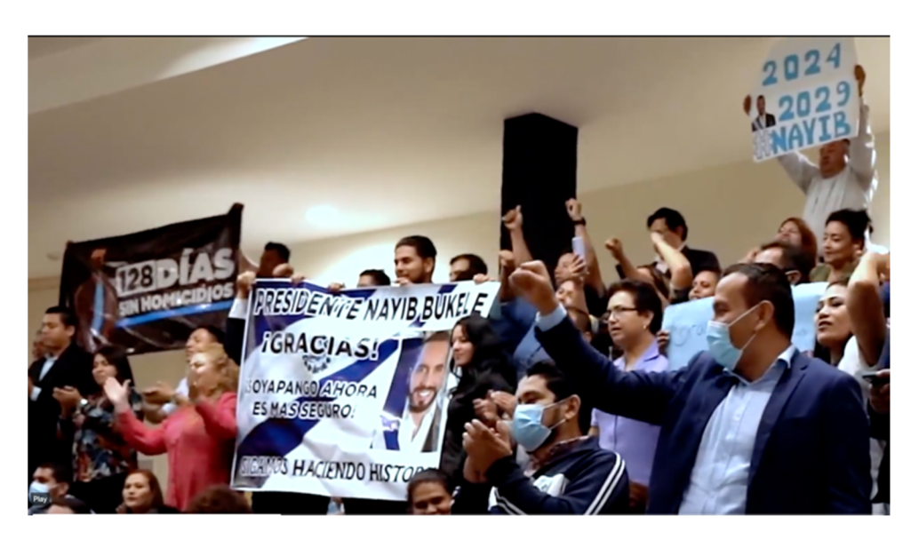
Figure 1. Bukele supporters on the mezzanine of the National Assembly.

The visible and audible presence of Bukele's supporters contrasts with the reality that Bukele has banned members of independent media outlets that are critical of him from attending his speeches or entering the presidential palace when other press are invited (Committee to Protect Journalists 2019).