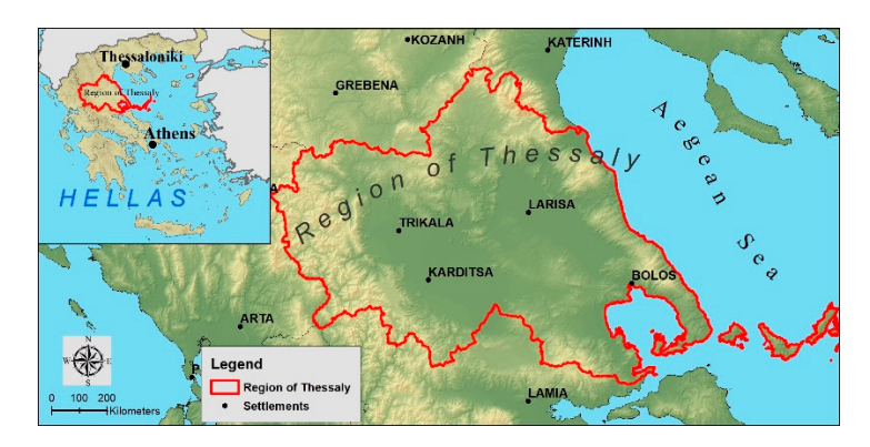
Figure 1. Study area.

gation amounts comes from groundwater systems through legal or illegal drilling, while only twenty-four (24) % comes from surface water systems [9]. The physical condition of groundwater systems in Thessaly is not satisfactory both in quantitative and quality terms [9]. In the present study, seven experimental plots were used in the research program "HubIS" and were analyzed and processed.