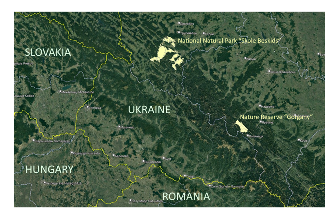
Figure 1. Location of the National Natural Park "Skole Beskids" and Nature Reserve "Gorgany" where the sample plots were established.

Sample plots were established in the old growth forests of the National Natural Park "Skole Beskids" and Nature Reserve "Gorgany" in the west of Ukraine (Figure 1) at altitude of 700–1400 m above sea level. For the choosing places for field measurements, we applied a uniform raster network in altitudinal and horizontal dimensions for the territory of Nature Reserve "Gorgany" and National Natural Park "Skole Beskids". Further, using results of forest inventory, we chose the plots (inventory compartments), where the average age of stands was 120 years and more. That type of disposition of sample plots (testing plots) guarantees the unbiassed character and contingency of territory coverage.