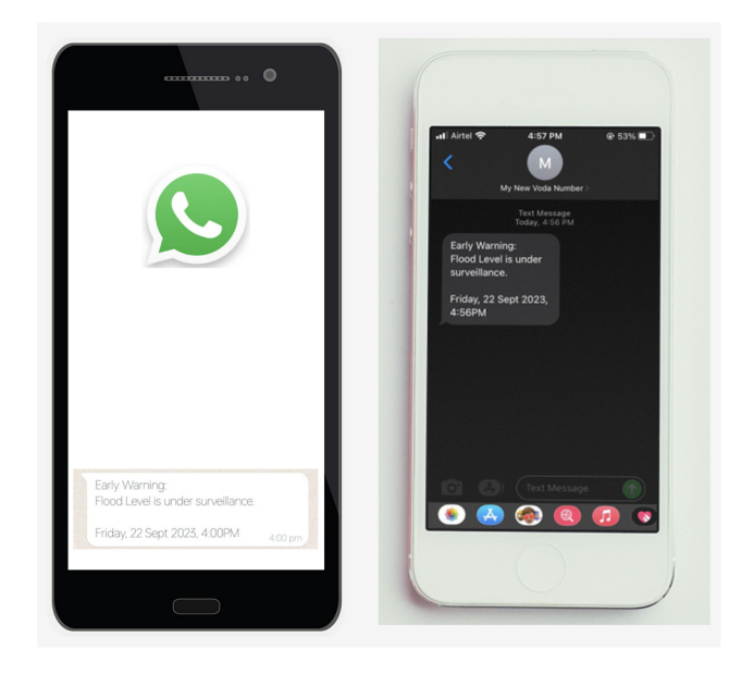
Figure 3. Output of the innovation.

The code serves as a basic framework that should be modified to fit the hardware, instrument interfaces, methods of communication, and flood detection techniques particular to your project. The proposed hardware is depicted in Figure 3. For the system to be reliable and resilient, it must have appropriate error management and safety features.