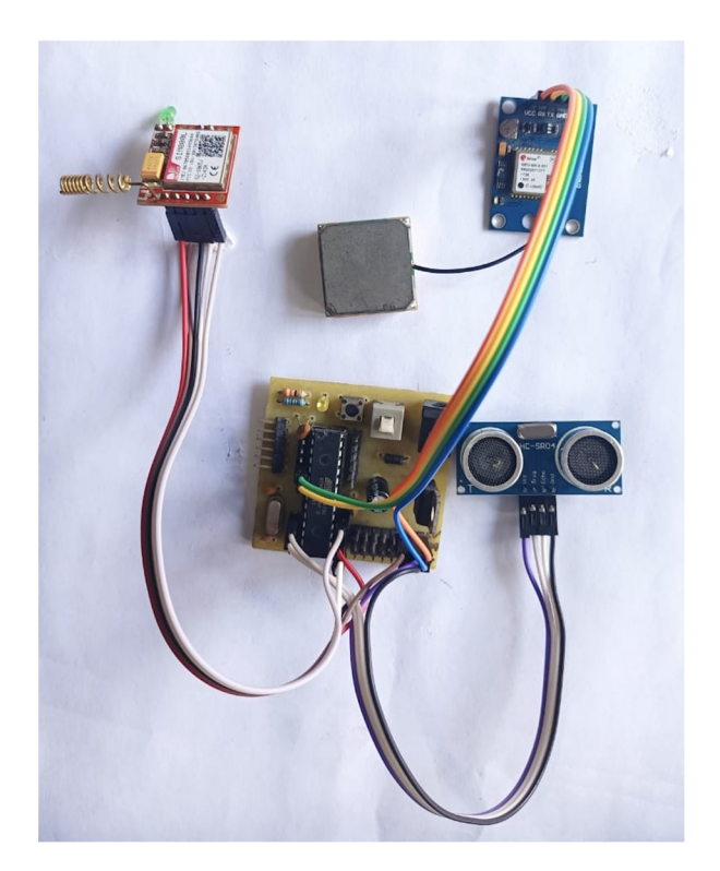
Figure 2. Proposed hardware of the proposed innovation.