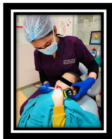
Figure 1. Extraoral vibration delivered.

Group 1: Extraoral vibrations were delivered using the commercially available device Buzzy (Buzzy ® , MMJ Labs, Atlanta, GA, USA). When using the device technique, the parent and child were first shown the device. The gadget was made accessible to the kids so they could touch it and use it. Readings from the pulse oximeter, MCDAS, and FLACC scale were noted. The device was then placed extraorally over the area to be anesthetized and switched on. Vibrations were delivered throughout the injection, and the deposition of the local anesthetic solution was carried out. Throughout this phase, readings from the MCDAS, FLACC scale, and pulse oximeter were recorded. After completing the procedure, the pain assessment was conducted using the Wong-Baker FACES scale, and the child was invited to choose one face (Figure 1).