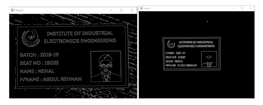
Figure 4. CED applied ID-S1 and ID-S2.

From histograms, the thresholding values for ID-S1 for upper and lower bounds were taken at 103 and 204, respectively. For ID-S2, the upper and lower bounds of 56 and 103, respectively, were considered for Canny edge detection (CED) because of the count of pixels with variance around \pm 30\% for particular intensity and contour localization, resulting in better character detection of both samples; see Figures 4 and 5.