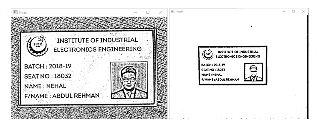
Figure 3. AGT applied to ID-S1 and ID-S2.

From histograms, the thresholding values for ID-S1 for upper and lower bounds were taken at 103 and 204, respectively. For ID-S2, the upper and lower bounds of 56 and 103, respectively, were considered for Canny edge detection (CED) because of the count of pixels with variance around \pm 30\% for particular intensity and contour localization, resulting in better character detection of both samples; see Figures 4 and 5.