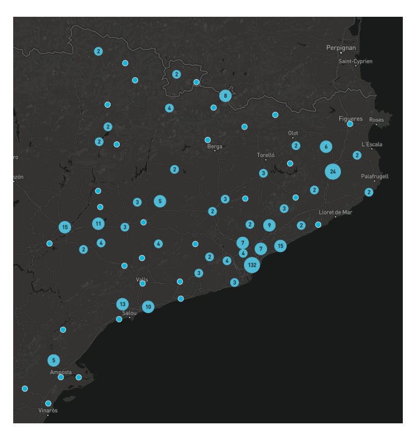
Figure 2. Schematic of the geographical distribution of the participating cities.

The questionnaire was open from 20 May 2020, until 12 June 2020. In total, 366 volunteers completed the questionnaire and uploaded their video. We analyzed the collected data, and decided to discard one entry because having an undetermined name ("La Ametlla"). Also, there was an entry from "Gavà Mar", which was labelled as "Gavà". Figure 2 shows a visual representation of the geographical distribution of the participating citizens and the distribution in the Catalan territory.