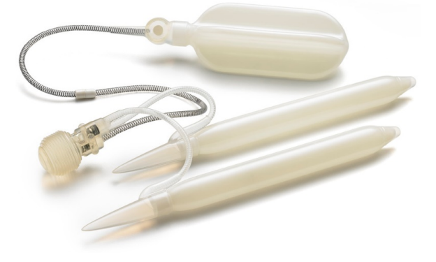
Figure 1. The Coloplast inflatable penile prosthesis Titan with One Touch Release pump and cloverleaf reservoir.

HydroVantage<sup>®</sup> (Figure 1). This hydrophilic coating could hold whichever antibiotics were used for the soak solution and prevent bacterial attachment [19].