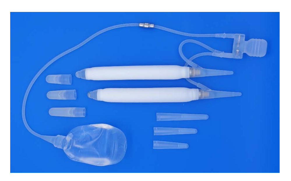
Figure 3. The ZSI475 for cis male implantation.