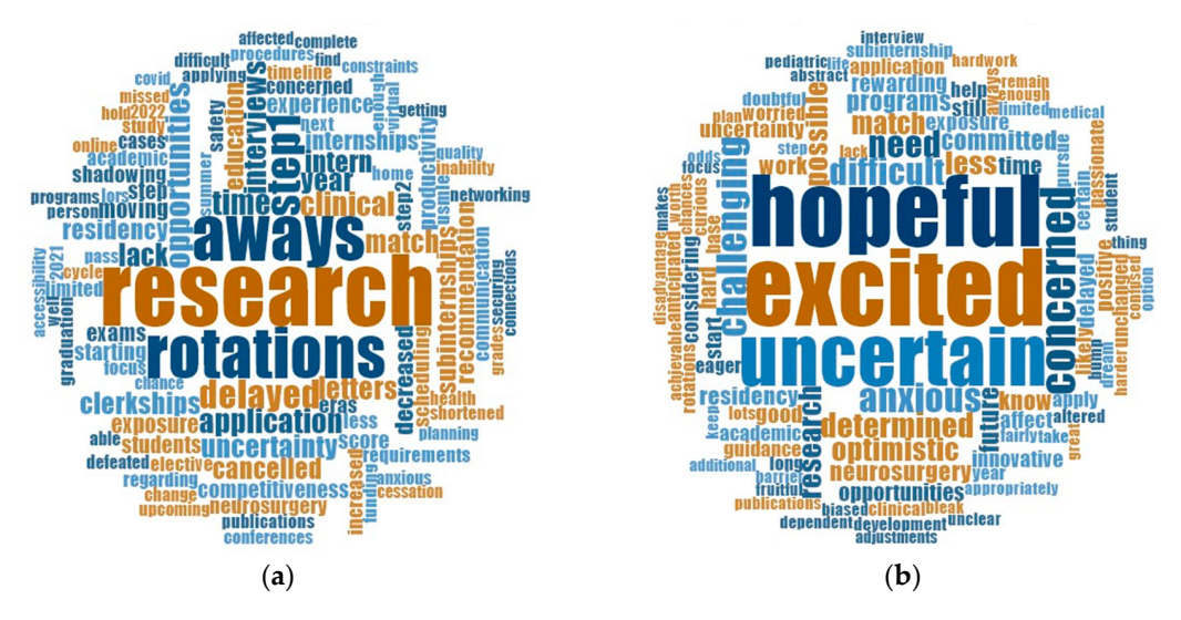
Figure 3. Word clouds generated from medical student and foreign medical graduate respondents pursuing careers in neurosurgery during the COVID-19 pandemic. Word clouds were generated from n = 379 medical students and foreign medical 'students' responses to two open-ended questions. The two survey questions were as follows: (a) list three words or short phrases [5 word limit] that best describe your 'immediate concerns' (b) list three words or short phrases [5 word limit] that best describe your 'thoughts' about your future in neurosurgery.

(60%, n = 165), except for FMGs (48%, n = 9; p < 0.001). In response to the complex nature of the pandemic, two open-ended questions were developed to allow participants to report 'immediate concerns' related to the pandemic and 'thoughts' on their future in neurosurgery. Figure 3a,b capture word clouds generated from these open-ended questions. The top five most common 'immediate concerns' in order of frequency were: 'research', 'aways', 'rotations', 'step1' [examinations], and 'delayed'. The top five reported 'thoughts on their future' were: 'excited', 'hopeful', 'uncertain', 'concerned', and 'challenging'. Finally, Table 2 summarizes the overall frequency and rank of priorities that could better support students pursuing careers in neurosurgery during the pandemic.