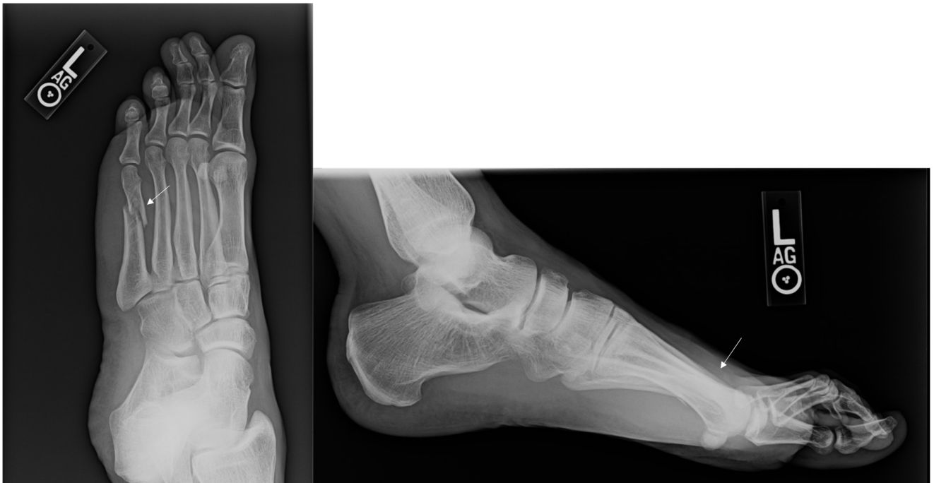
Figure 3. Radiographs of a Metatarsal Fracture Displaced 3–4 mm. Displayed above are radiographs of a fifth metatarsal shaft fracture that is displaced between 3–4 mm. The arrows above identify the fifth metatarsal fracture.