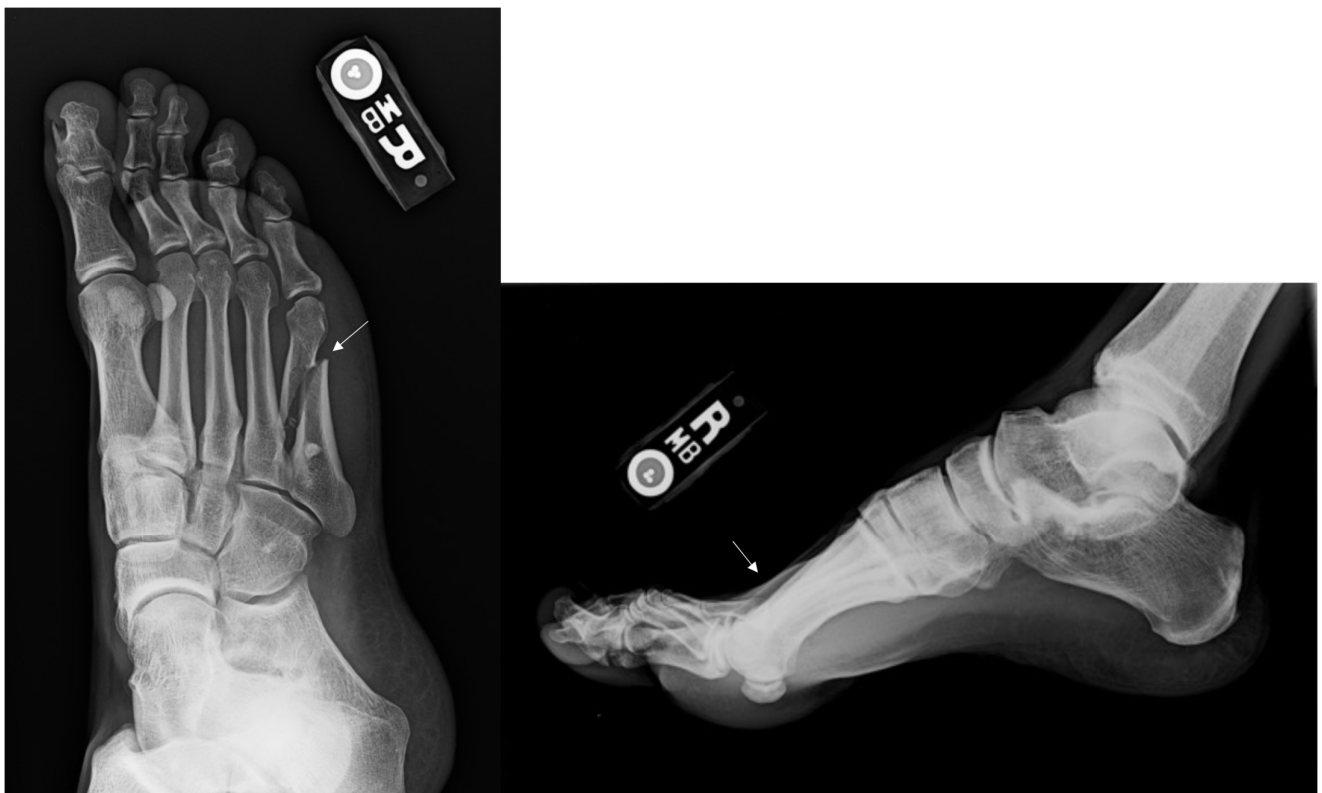
Figure 4. Radiographs of a Metatarsal Fracture Displaced Greater than 4 mm. Displayed above are radiographs of a fifth metatarsal shaft fracture displaced greater than 4 mm. The arrows above identify the fifth metatarsal fracture.