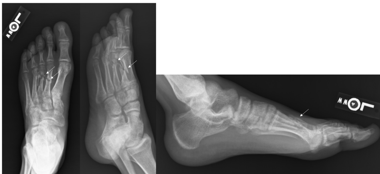
Figure 1. Injury Films for Displaced Metatarsal Fractures from a Gunshot. Displayed above are the injury radiographs for second and third metatarsal fractures following a gunshot injury. The arrows above identify the metatarsal fractures.

Gender, age, treatment type, type of fracture, initial radiographic displacement and angulation, ability to run and presence of a medical board are displayed above for all cases. Patients were placed into either a hard sole shoe (HSS), CAM walker boot, short leg cast (SLC), splint or normal shoe wear.