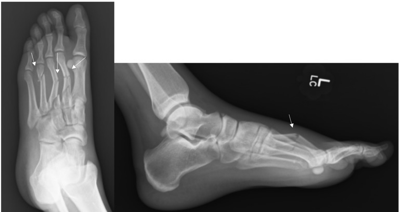
Figure 5. Radiographs of a Metatarsal Fracture Angulated greater than 10 degrees. Displayed above are radiographs of second, third and fourth metatarsal fractures with angulation greater than 10 degrees. The arrows above identify the central metatarsal fractures.