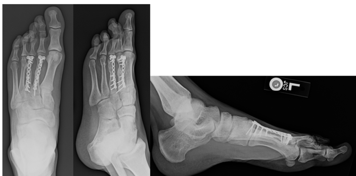
Figure 2. Post-operative Images for Displaced Non-union. Displayed above are the radiographs for second and third metatarsal fractures following a gunshot injury that underwent ORIF due to a non-union.