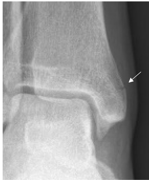
Figure 2. Zoomed view of right ankle AP demonstrating medial malleolar fracture.