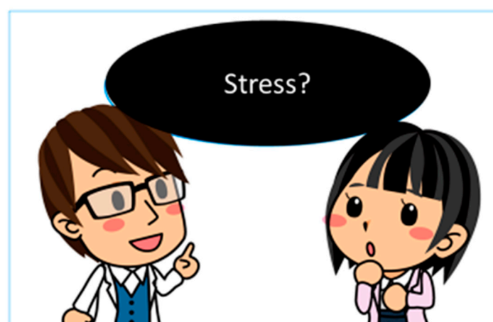
Figure 1. Example slide from the ICBT program.