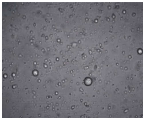
Figure S2. Microscopic image of liposomes at 400 X magnification.