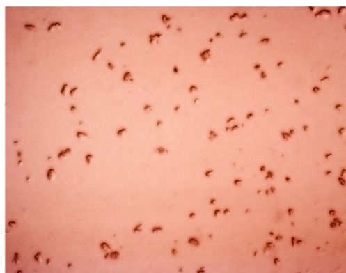
Figure S3. Microscopic image of liposomal encapsulated myricetin at 400 X magnification.