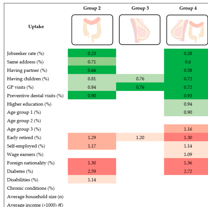
Figure 2. Positive/negative associations between municipal characteristics and BC/CRC screening uptake municipality profile. The reference category is: Group 1 (high BC, high CRC); Group 2: high BC, low CRC; Group 3: low BC, high CRC; Group 4: low BC, low CRC. Darker colors correspond to higher levels of significance (progressively, p values between 0.05 and 0.01, between 0.01 and 0.001, lower than 0.001).

a The reference category is: Group 1 (high BC, high CRC); Group 2: high BC, low CRC; Group 3: low BC, high CRC; Group 4: low BC, low CRC. Significant p values are indicated with asterisk (*).