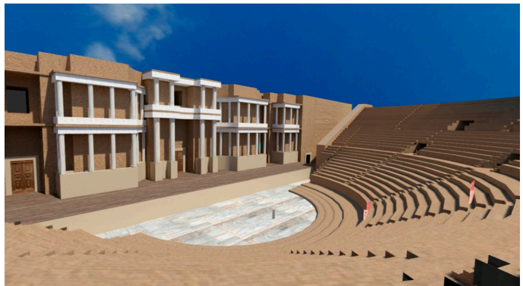
Figure 1. 3D model of the Roman theatre in Gortyna.

Manzetti began by raising some issues. The first concerned the type of sound events that could have taken place in the theatre and whether, due to its acoustic characteristics, it was more suitable for listening to music or for outdoor public speeches. Closely connected to the first, the second issue concerned the assessment of a correspondence between written sources (which recall music and sports competitions related to the celebrations of Apollo Pitius) and a possible performance of these competitions in the theatrical area related to the sanctuary of the divinity in Gortyna. In order to address these issues, she carried out a virtual acoustic analysis, taking into account some limitations that she might encounter: first of all, the state of preservation of the theatre, which made the assessment and acoustic analysis on the site complex. Therefore, it was necessary to build a 3D model of the monument (Figure 1) [14] using software suitable to calculate the acoustic features and to evaluate the behaviour of sound in a virtual environment.