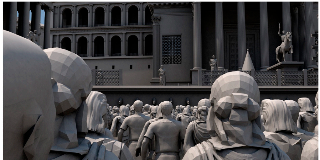
Figure 2. Virtual demonstration “Public Speech on Forum Romanum”.