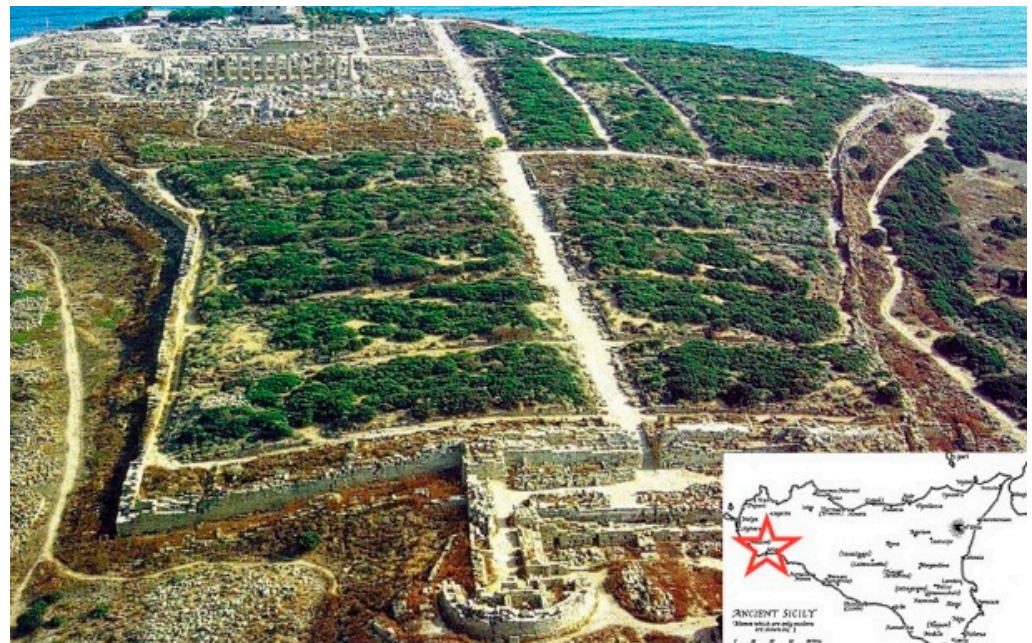
Figure 4. The ancient site of Selinunte in Sicily.

This survey revealed surprising sonic qualities in the theatral area. Given that the theatral structure is not fully preserved, we worked on a 3D model of this theatral building and we used software that is able to calculate acoustic values. Thanks to the development of a virtual application for Oculus Rift, we explored the 3D reconstruction of the theatral area (Figure 5) [31] in the Acropolis of Selinunte and, at the same time, listened to the auralisation from different positions; audio files of the recorded musical performances were also used in our survey. The main aim of this VR application, developed through Unity, is to experience theatres as an ancient listener. Therefore, we developed the VR application through two phases: the first was the 3D modelling and texturing of the theatral area; and the second was the auralisation of an anechoic file of a musical performance from different positions in the 3D model of the theatral structure and its immediate surroundings.