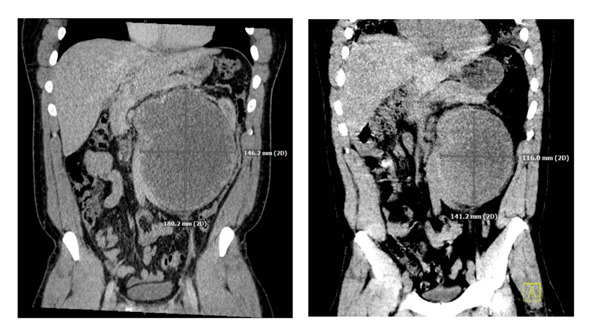
Figure 1. Coronal slices of CT images performed immediately after diagnosis of retroperitoneal mass ( left ) originally measuring 18 \times 14 cm, and three months after initiation of treatment ( right ) measuring 14 \times 12 cm.