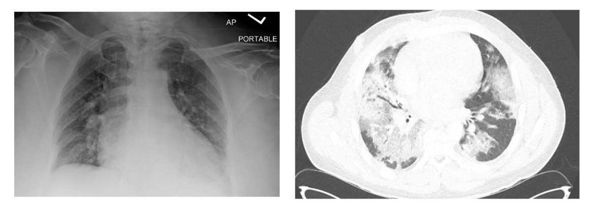
Figure 2. Chest radiograph ( left ) and axial image from chest CT ( right ) showing patchy opacifications on the day of admission.