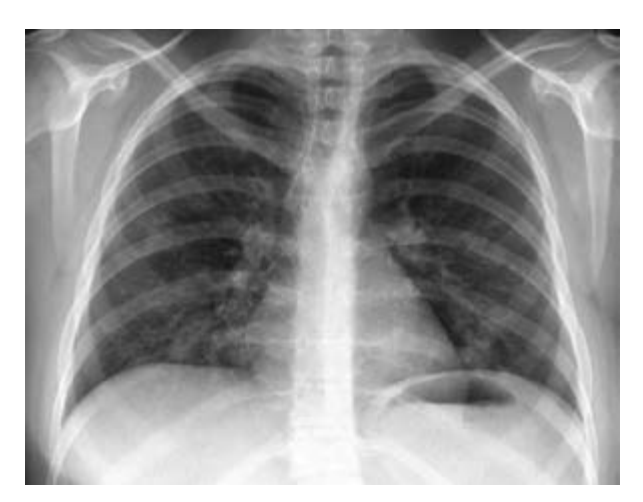
Figure 1. Posteroanterior chest X-ray shows bilateral ill-defined parahilar and lower-lobe opacities

in both lungs forming the areas of ground-glass attenuation (Fig. 2A). After blood transfusion, the concentration of haemoglobin increased to 8.5 g/dl, but 1 week later, haemoptysis occurred with re-decrease in haemoglobin. The patient received antibiotics and underwent blood transfusion again and was transferred to our Department for further diagnosis (The National Research Institute of Tuberculosis and Lung Diseases in Warsaw).