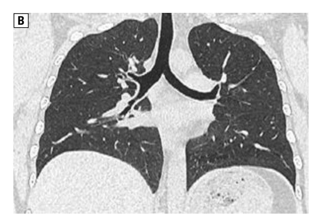
Figure 3 A, B. CT scans (axial reformations) show complete regression of ground-glass opacities after six months