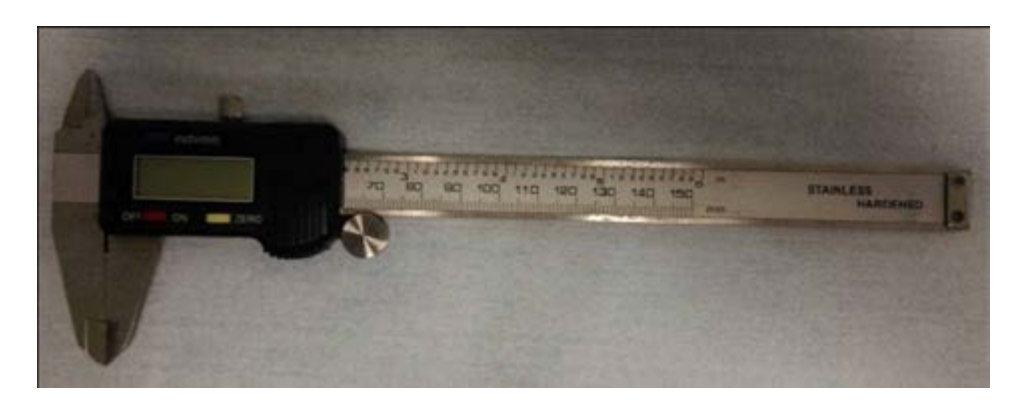
Figure 1. Electronic caliper device used in the measurement of the tissue samples

yield of each technique was demonstrated. A diagnostic technique was only defined when a final histopatholocal diagnosis was obtained.