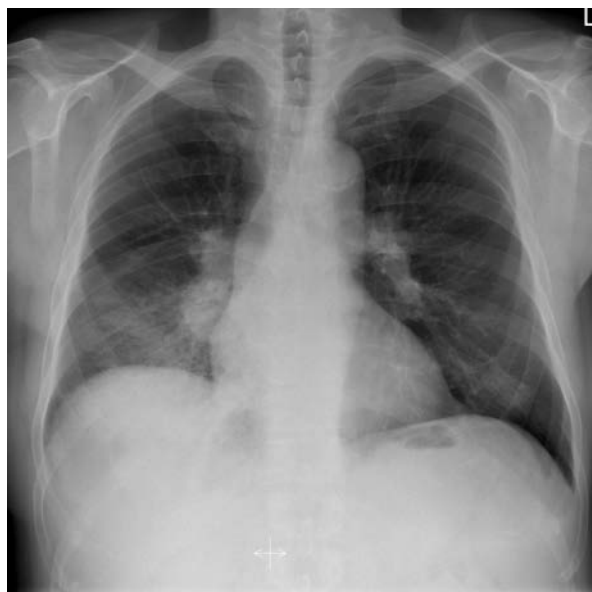
Figure 1. Chest X-ray. Opacities in the right lower zone and widened right hilum and mediastinum

He was admitted in moderate condition, with dyspnea, exhausting cough and weakness; blood