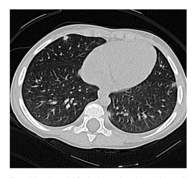
Figure 2. Irregular, well-defined nodules and round, interstitial consolidation mainly located in subpleural parts of both lungs. Chest CT with contrast — pulmonary window

All (T+/P+) patients were treated with albendazole at a daily dose of 10 mg/kg of body weight in a 5-day administration. Six month after therapy the children had the radiological examination repeated. The patients presented two models of recovery. The children with well defines lesions in their first examination, developed pulmonary calcifications located in peripheral (subpleural) areas of the lungs. The pulmonary nodules calcification suggested the granulomas formation, in the response to healed infection (Fig. 4). The children, who had GGO in