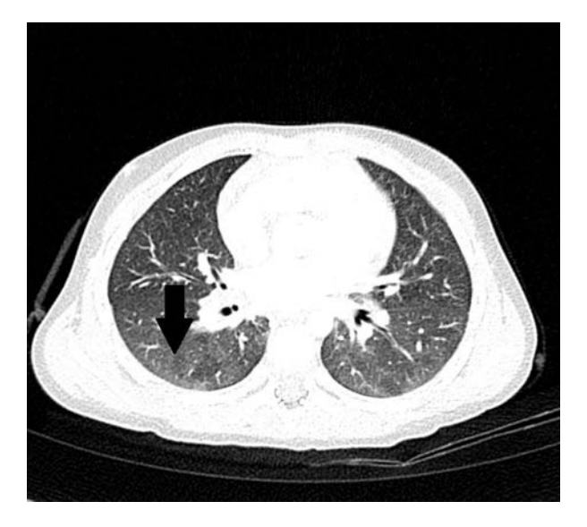
Figure 3. Non-marginated areas of ground-glass opacities (black marker) in basal lobes of both lungs. Chest CT without contrast — pulmonary window